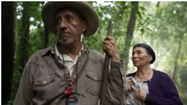
I Dream In Another Language

Vancouver Queer Film Festival (VQFF), the city's second largest film fest gets under way in one week. Running August 10 to 20, 2017, VQFF brings 11 days of award winning films, talkbacks, performances and parties.